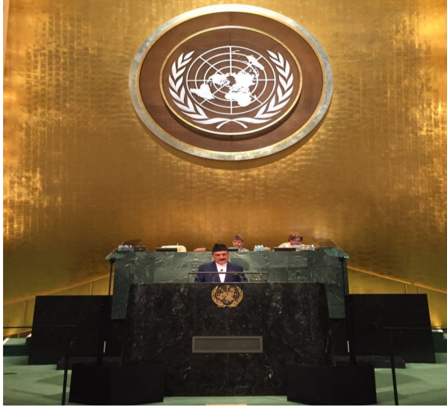
Some pictures of the same occasion