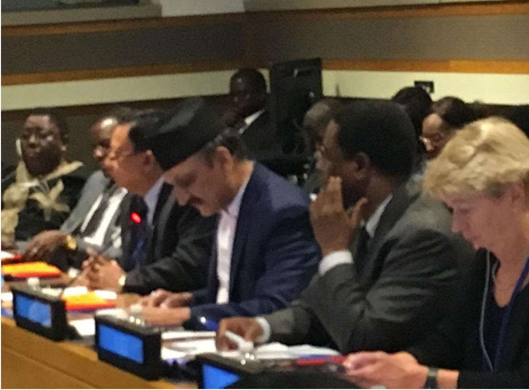
The Hon. Minister in the annual Ministerial Meeting of the LDCs (above) and with his Thai Counterpart (below)