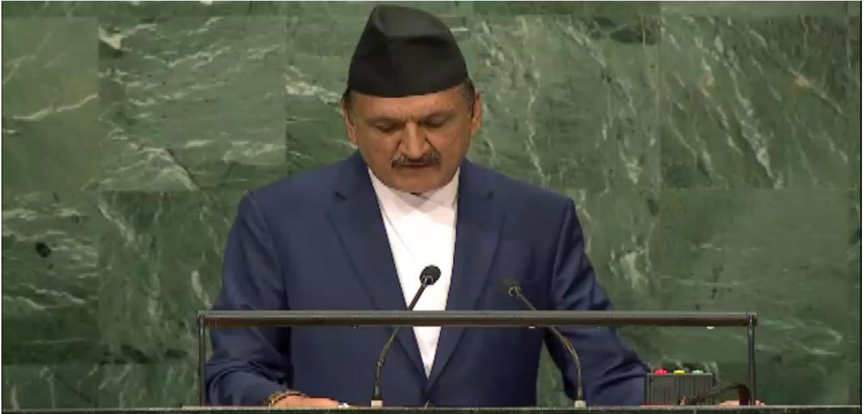
The Hon. Minister addressing the 71 st session of the UNGA