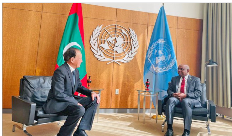
The Foreign Minister with the President of the 76 th UNGA

On the margins of the 76 th UNGA, Foreign Minister Dr. Narayan Khadka held a bilateral meeting with Mr. Abdulla Shahid, President of the 76 th session of the United Nations General Assembly, at the latter's Office on 25 September 2021.