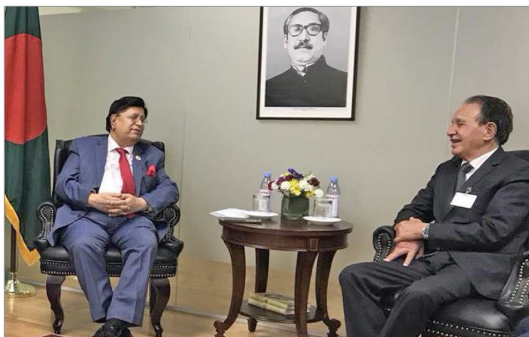
The Foreign Ministers of Nepal and Bangladesh in the Meeting

The Foreign Minister also held a bilateral meeting with Dr. A.K. Abdul Momen, Minister of Foreign Affairs of Bangladesh on 25 September 2021. During the meeting, the two Ministers exchanged views on promoting bilateral, regional, and multilateral cooperation. The discussion was focused on the need for enhanced collaboration in the areas of trade, investment, hydropower development and cross-border energy, trade among others. Both leaders