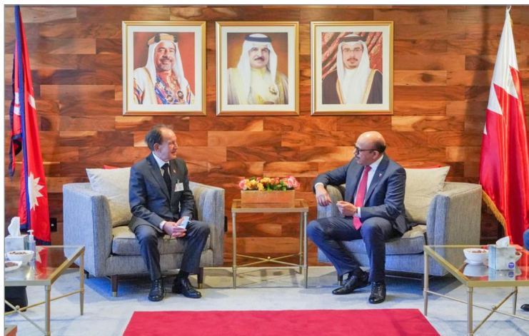
The Foreign Minister in Meeting with the Foreign Minister of Bahrain

economies of the LDCs, including Nepal, he also called for equitable, affordable, and universal access to vaccines.