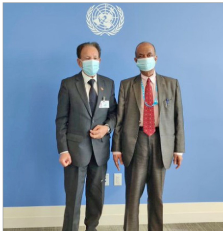
The Foreign Minister with the Under-Secretary-General of the Department of Operational Support

Sabah on 23 September 2021. Matters of mutual interests including trade, investment, tourism, resumption of a direct flight, and people-to-people contacts were discussed on the occasion. Both sides agreed to work together in addressing the issues of migrant workers including those of domestic service workers in Kuwait.