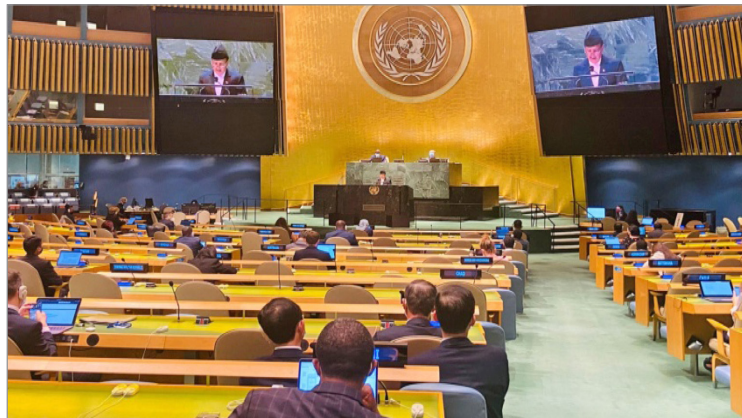
The Foreign Minister Addressing the General Debate of the 76 th UNGA Session

On the occasion, the Foreign Minister also outlined Nepal's foreign policy priorities and underlined the indispensability of multilateralism with the United Nations as its centre to build global understanding and cooperation, promote shared interests, and secure our common future. He also expressed Nepal's support on the measures and initiatives taken for UN reforms and