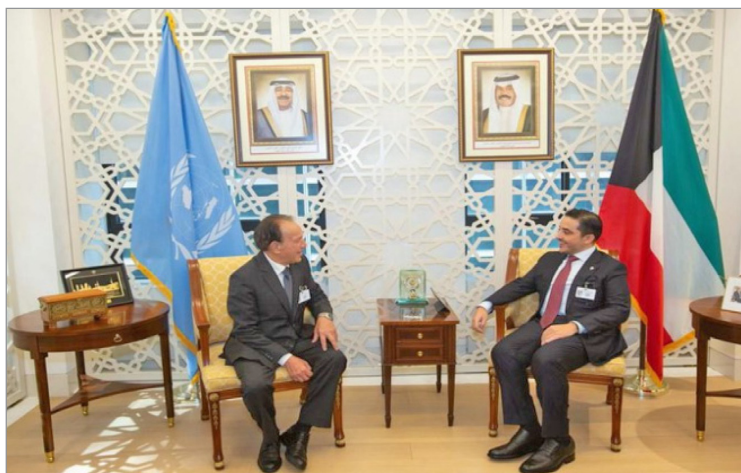
The Foreign Minister with the Foreign Minister of Kuwait

On 27 September 2021, Foreign Minister Dr. Narayan Khadka met Under-Secretary-General of the Department of Operational Support Mr. Atul Khare. During the meeting, USG Mr. Khare thanked Nepal for its contribution in peacekeeping, while also mourning on the loss of fallen soldiers in service.