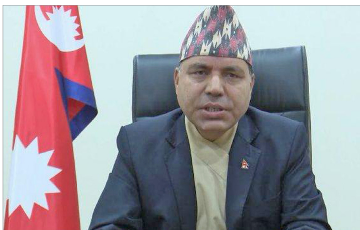
The Foreign Secretary Addressing the Annual Ministerial Meeting of LLDCs

The 10 th Ministerial Conference of the Community of Democracies was held virtually under the