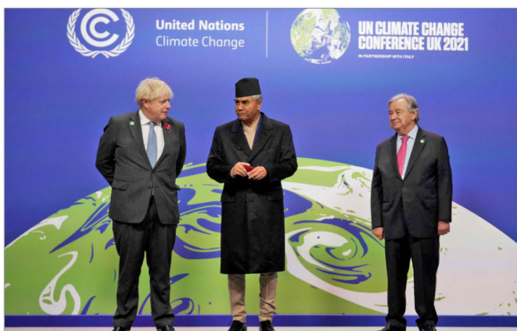
The Prime Minister with the British Prime Minister and the UN Secretary General during CoP26 Conference

On the sidelines of the Conference, Prime Minister Sher Bahadur Deuba held separate bilateral meetings