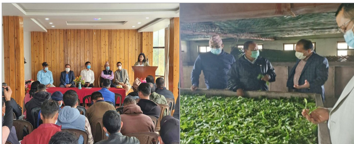
Interaction with Local Tea Entrepreneurs at Jhapa and Ilam in Province No. 1

tea export and also discussed on the role of the Foreign Ministry and the Nepali diplomatic missions abroad in facilitating the export of tea from Nepal.