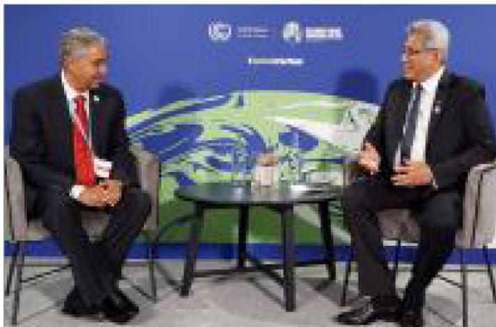
The Prime Minister with the President of Sri Lanka