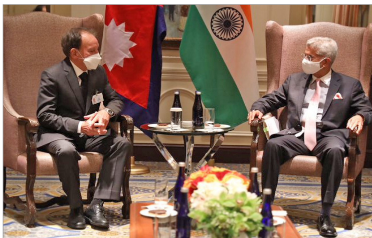
The Foreign Minister with the External Affairs Minister of India

Foreign Minister Mr. Khadka had a bilateral meeting with Dr. S. Jaishankar, External Affairs Minister of India, in New York on 26 September 2021. During the meeting, the two Ministers reflected on the multifaceted aspects of bilateral relations between Nepal and India, and expressed their readiness