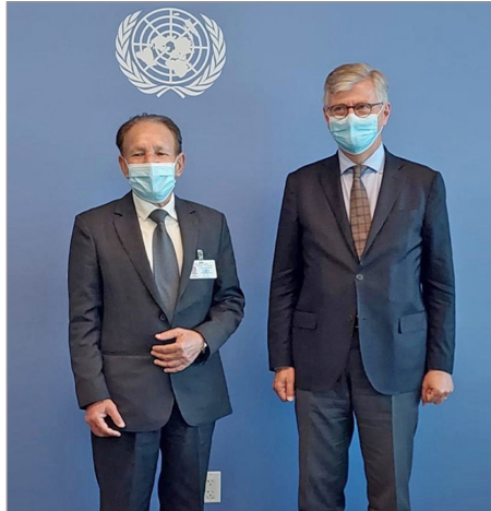
The Foreign Minister with the United Nations Under-Secretary-General for Peace Operations

Congratulating Mr. Shahid on the assumption of the role of the President of the 76 th session of the United Nations General Assembly, the Foreign Minister assured him of Nepal's full support in the discharge of his duties. Foreign Minister also expressed Nepal's support to the priorities of the PGA set for the UNGA in making the UN better and more functional.