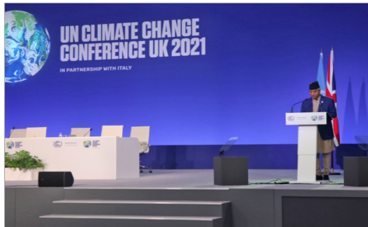
The Prime Minister Delivering the Keynote Speech during CoP26 Conference

The Prime Minister also mentioned that Nepal remains firmly committed to the implementation of