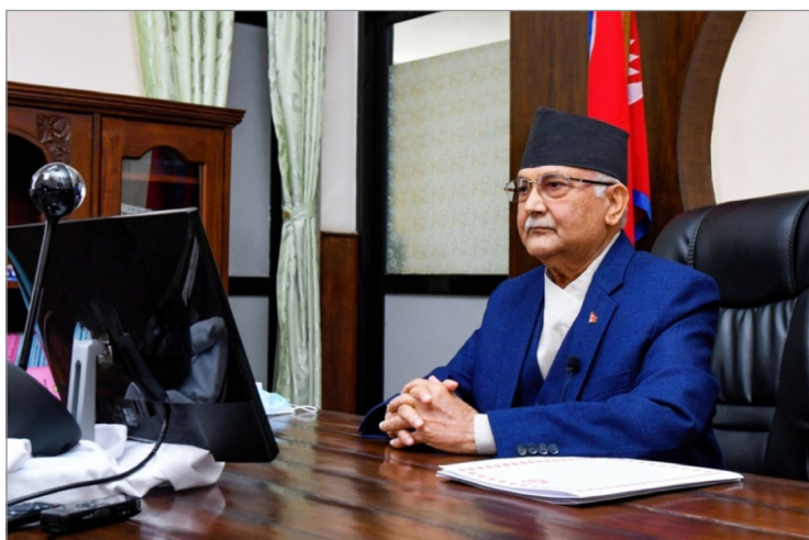
Prime Minister addressing the 26th International Conference on the Future of Asia virtually

Addressing the Conference, Prime Minister Oli highlighted Asia’s history of civilization, time-tested Asian values of fraternity, peaceful co-existence and sense of justice, and its gradual resurgence in shaping global agenda. Calling for the “whole of the region” and “whole of the world” approach, he stressed on global cooperation, unity and solidarity as the means to overcome COVID-19 and build back better and