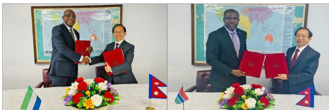
Permanent Representative of Nepal to UN with Permanent Representatives of Gambia (at the left) and Sierra Leone (at the right) during the signing ceremonies of diplomatic relations in New York