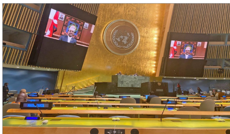
DPM and FM of Nepal delivering statement at the Joint Thematic Event on LDCs

Addressing the Joint Thematic Event on Least Developed Countries (LDCs), convened by the Presidents of the General Assembly and the Economic and Social Council on 18 June 2021 under the theme of 'Diversifying the Financing Toolbox to Enhance Investment in Least Developed Countries', Deputy Prime Minister and Minister for Foreign Affairs Mr. Raghuraj Mahaseth stressed that the development partners need to live up to their financing commitments to help address the investment gaps in the