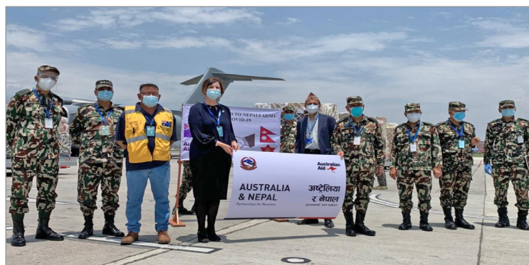
Ambassador of Australia to Nepal handing over the medical supplies to Nepal Army