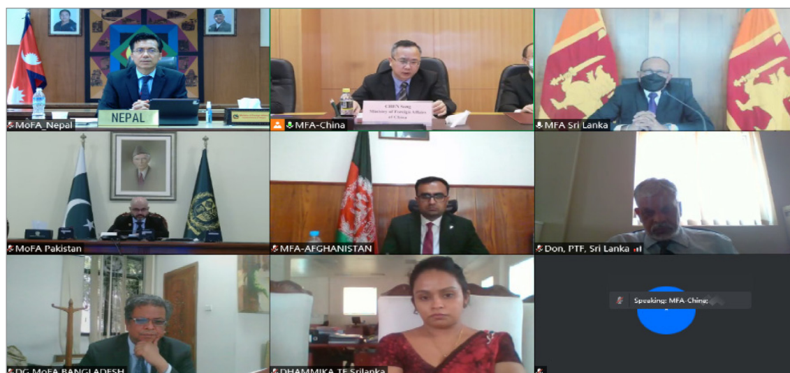
Second Meeting of the Working Group on COVID-19 Response and Poverty Alleviation