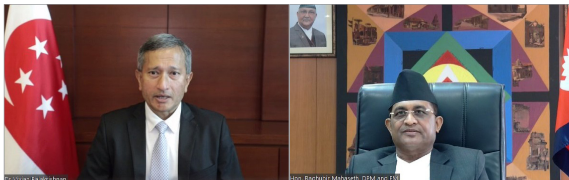
Deputy Prime Minister and Foreign Minister of Nepal and the Foreign Minister of Singapore during the virtual Meeting

thanked the Foreign Ministry of Singapore as well as Temasek Foundation International and its