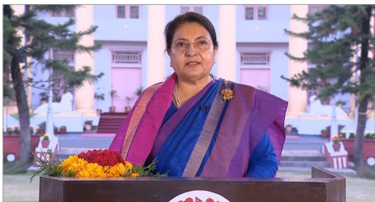
President of Nepal delivering the video message at 2021 P4G Seoul Summit

In her address, President Bhandari reiterated Nepal's commitment of becoming a carbon-neutral country by 2050. Focussing her intervention on "Inclusive Green Recovery from COVID-19", the President emphasized the importance of investing in climate adaptation in the least developed countries by increasing their access to climate finance