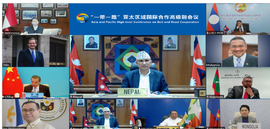
Deputy Prime Minister and Minister for Finance attending the Asia and Pacific High-Level Conference on Belt and Road Cooperation

global partnership in defeating COVID-19 and prioritizing LDCs and poorer countries for COVID vaccine cooperation. The Conference