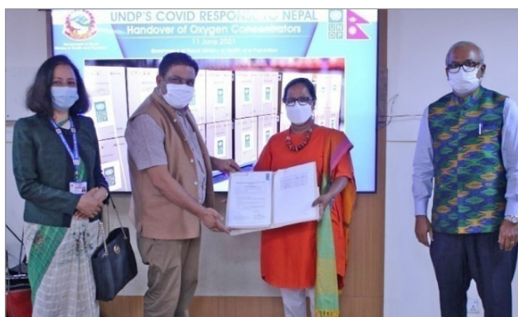
Handing over ceremony of COVID - related assistance from UNDP Nepal