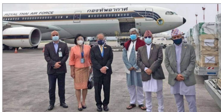
Nepal's Ministers along with Thai Ambassador during the handover ceremony

Queen Suthida Bajrasudhabimalalakshana and Princess Bajrakitiyabha