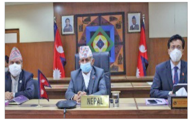
Foreign Minister leading Nepali delegation to the video conference on Joint Response to COVID-19

Minister for Foreign Affairs Mr. Pradeep Kumar Gyawali a Nepali delegation to a video conference of the Foreign Ministers of Afghanistan, Bangladesh, China, Nepal, Pakistan and Sri Lanka on Joint Response to COVID-19 held on 27 April 2021. Addressing the conference, Minister Gyawali stressed on the enhanced level of regional and international cooperation for COVID-19 response and economic