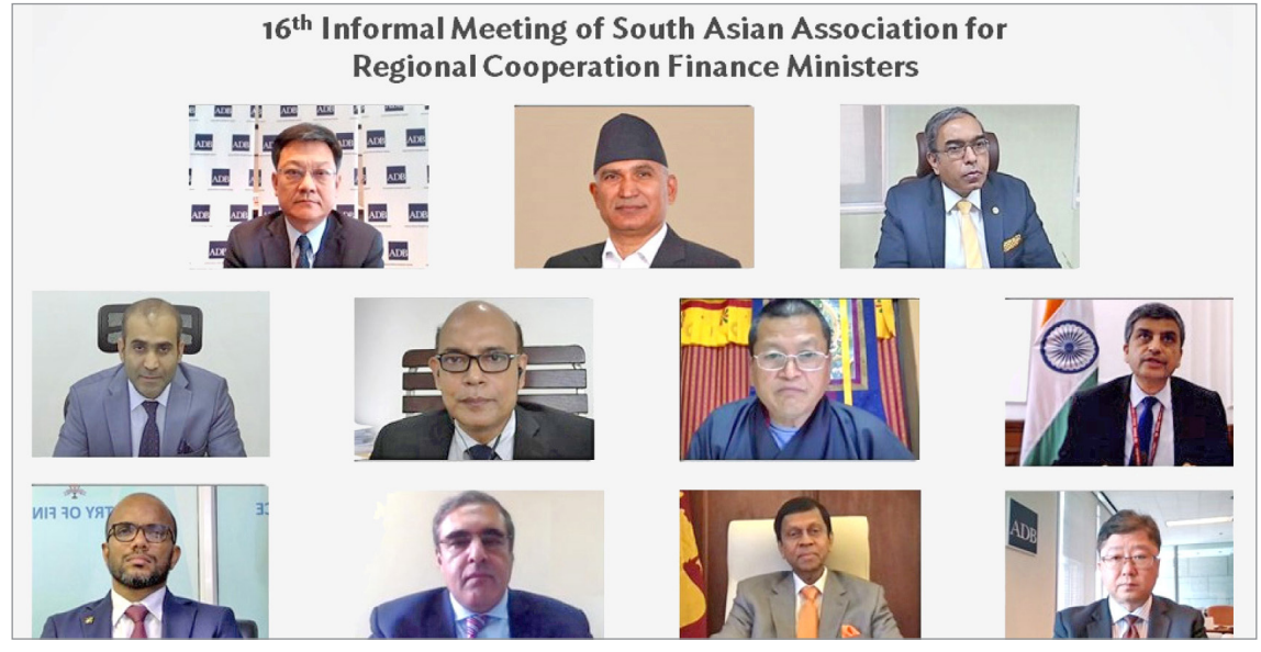
16th Informal Meeting of SAARC Finance Ministers