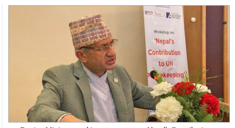
Foreign Minister speaking at an event on Nepal's Contribution to UN Peacekeeping

Minister for Foreign Affairs Mr. Pradeep Kumar Gyawali, addressed an event on 'Nepal's Contribution to UN peacekeeping' organized by Institute of South Asian Studies (ISAS), Consortium of South Asian Think Tank (COSATT), and Konrad Adenauer Stiftung (KAS) on 19 April 2021. The Foreign Minister, in his address,