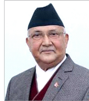
The Prime Minister

The Prime Minister stated that while commemorating the Charter Day, Covid-19 pandemic presents an unprecedented challenge affecting not only health and economy but also social life and livelihoods in the region and beyond. He said that the situation underlines the importance of more concerted efforts, collaboration and cooperation among the Member States of SAARC in order to collectively emerge from the pandemic. The Prime Minister also said that time has come to move forward with concrete action in the ground with needed political