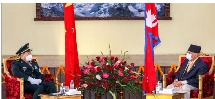
Mr. Wei Fenghe, State Councilor and Defense Minister of the People's Republic of China paying a courtesy call on the Prime Minister

Both sides exchanged views on matters of mutual interest, including the matters of further promoting traditionally friendly relations between Nepal and China.