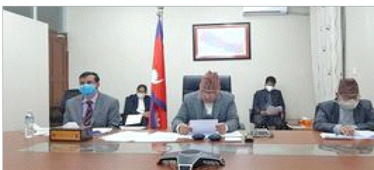
Nepal-Canada 2nd Bilateral Consultation Meeting

A wide range of matters relating to bilateral relations and cooperation were discussed, while reviewing the progress made since the