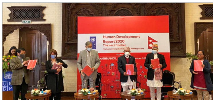
The Foreign Minister launching Human Development Report 2020

Foreign Minister Mr. Pradeep Kumar Gyawali launched Human Development Report 2020 amid a special function organized by UNDP Nepal on 16 December 2020. On the occasion, the Foreign Minister highlighted that the HDI report 2020 has re-interpreted the concept of human development, incorporating the issues of climate change and environmental degradation. The report talks