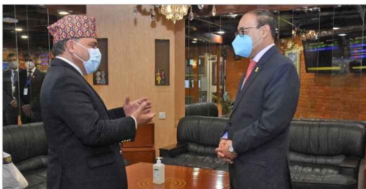
The Foreign Secretary of Nepal welcoming the Foreign Secretary of India.

The meeting reviewed various aspects of Nepal-India relations covering trade, transit, connectivity, infrastructure, energy,