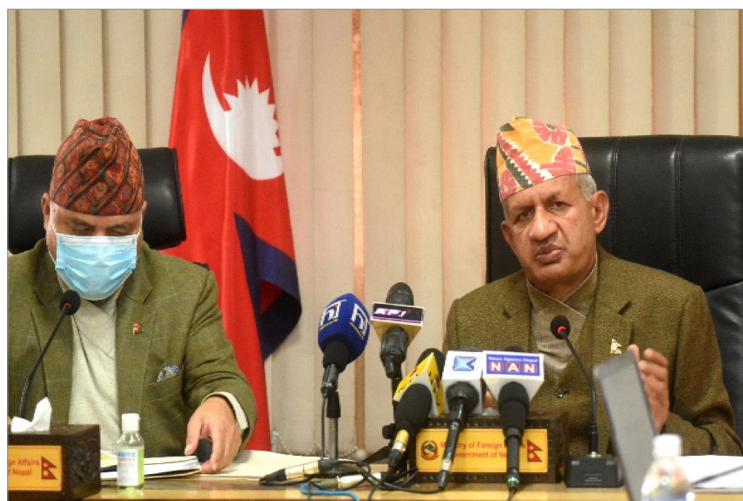
Minister for Foreign Affairs Mr. Pradeep Kumar Gyawali speaking on Foreign Policy, 2077