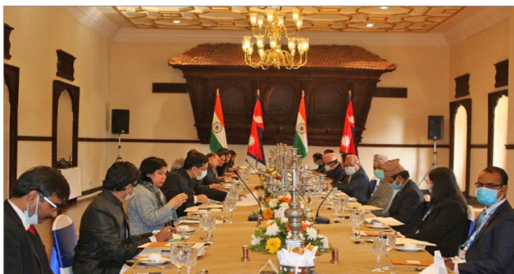
Working luncheon hosted by the Foreign Secretary in honour of visiting Indian Foreign Secretary

Both sides shared their experiences on the efforts made to fight against Covid-19 pandemic. The Foreign Secretary of Nepal