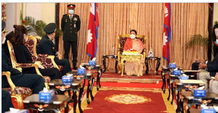
Mr. Wei Fenghe, State Councilor and Defense Minister of the People's Republic of China and his delegation paying a courtesy call on the President of Nepal

During the visit, Mr. Fenghe paid courtesy calls on Mrs. Bidya Devi Bhandari, the President of Nepal and Mr. K P Sharma Oli, the Prime Minister and Defense Minister of Nepal.