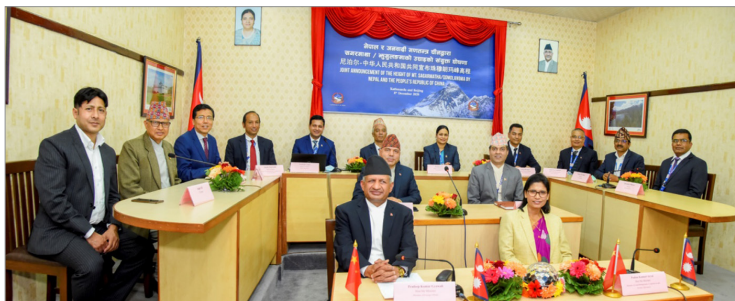
Minister for Foreign Affairs and Minister for Land Management, Cooperatives and Poverty Alleviation Announcing the New Height of Mount Sagarmatha

Alleviation from the Nepali side and Mr. Wang Yi, State Councilor and Foreign Minister, and Mr. Lu Hao, Minister of Natural Resources from the Chinese side jointly unveiled the new height.