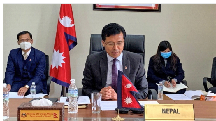
Head of North East Asia Division leading the Nepali Delegation in the Discussion on Covid-19 and Poverty Alleviation

During the meeting, the Working Group discussed extensively to build back better from adverse COVID-19 impacts through strengthened