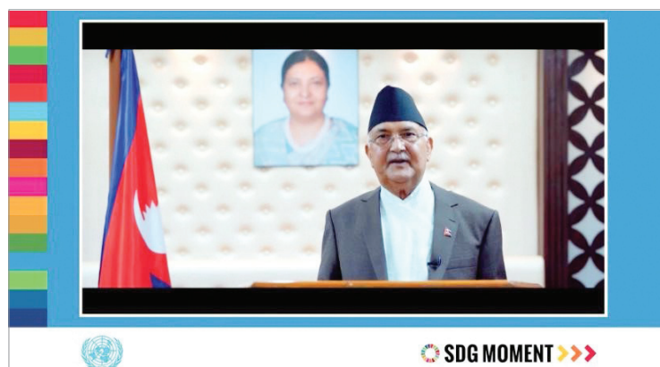
Prime Minister delivering his statement at SDG Moment 2020

Prime Minister Mr. K P Sharma Oli also addressed the United Nations Summit on Biodiversity on 30 September 2020, held under the theme, "Urgent Action on Biodiversity for Sustainable Development". Delivering the