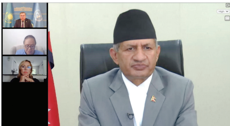
Foreign Minister addressing the 19th Annual Ministerial Meeting of LLDCs

In his address, the Foreign Minister underlined the relevance of the Bandung Principles as time-tested and sacrosanct ideals for the peaceful global order. "With its numerical and moral strength,