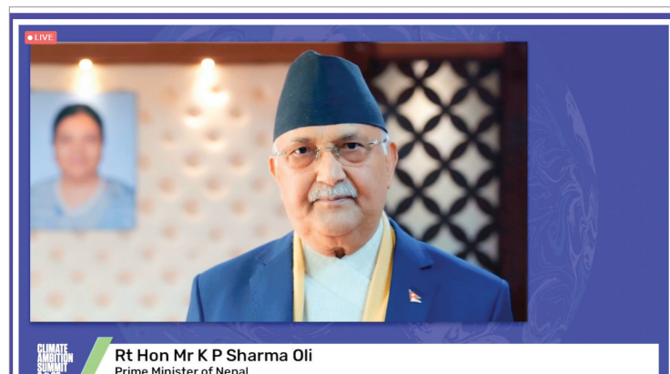
Prime Minister at the Climate Ambition Summit 2020

Prime Minister Oli also shared the responses of the Government of Nepal aimed at protecting people's lives, strengthening health care system, and building a sustainable and resilient recovery. He further stressed the need for global solidarity