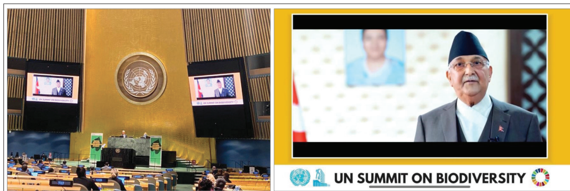
Prime Minister Oli addressing the UN Summit on Biodiversity

“With only a decade left to achieve the 2030 Agenda, progress made in poverty reduction should be a primary indicator of assessing our overall development efforts”, the Prime Minister stated in his statement. The Prime Minister stressed the need for investing in people and preventing them from re-lapsing into poverty as a key challenge amidst the current health and economic crisis. He shed light on the Government’s targeted programs on reducing poverty, illiteracy, and unemployment, and outlined the efforts made towards improving the delivery of essential services including universal access to renewable energy, basic water supply and sanitation.