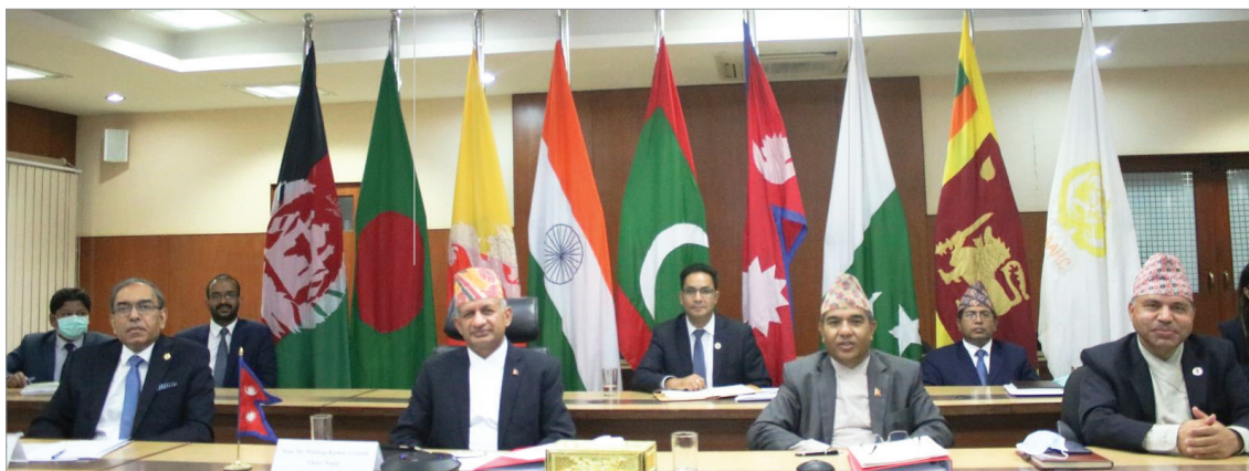
Informal Meeting of the SAARC Council of Ministers

Nepal hosted the Virtual Informal Meeting of the SAARC Council of Ministers on 24 September 2020 on the sidelines of the 75 th session of the United Nations