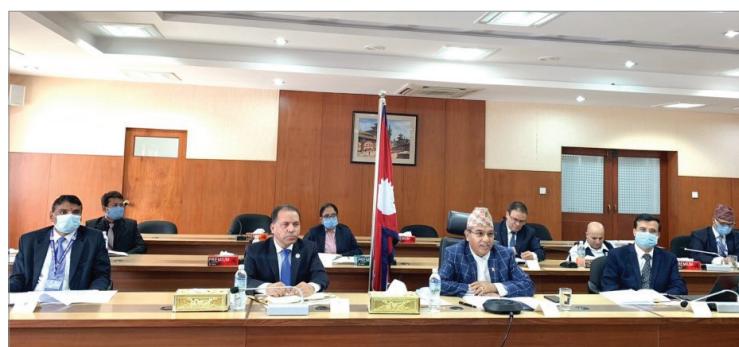
Foreign Secretary leading Nepali delegation to Nepal-Germany 2 nd BCM

In the meeting, the two sides took stock of overall state of the bilateral relations and cooperation between Nepal