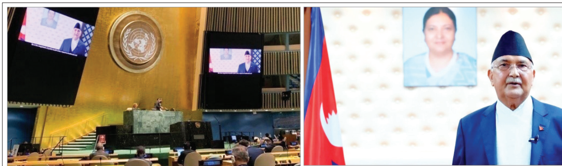
Prime Minister addressing the 75 th session of UNGA through a pre-recorded video

The 75th UNGA was held under the theme of “ The Future We Want; the United Nations We Need: Reaffirming Our Collective Commitment to Multilateralism – Confronting COVID-19 through Effective Multilateral Action ”, in the mixed format of virtual and physical participation of the delegates due to the outbreak of the COVID-19 pandemic.