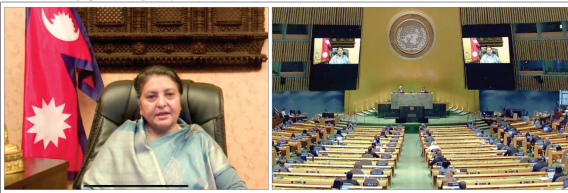
President addressing the Twenty-fifth Anniversary of the Fourth World Conference on Women

She also highlighted Nepal’s major achievements on women’s empowerment, including mainstreaming of gender agenda in the national