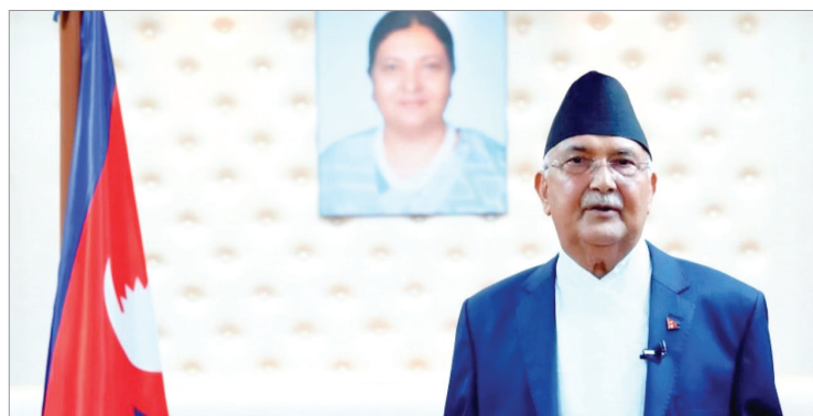
Prime Minister addressing the High-level Meeting to commemorate the 75th Anniversary of UN

The Prime Minister expressed satisfaction on the ever-growing partnership between Nepal and the UN in all three pillars - peace and security, development, and human rights. “Nepal has been providing one of the most dedicated and professional services to the UN peace operations for over six decades”, he mentioned. He stated that there is no alternative to unity, solidarity and cooperation, and we must reaffirm these