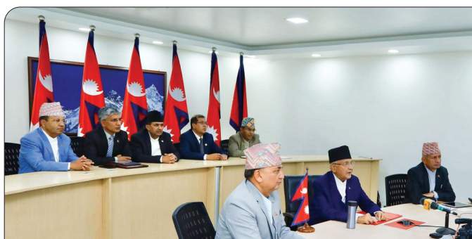
Prime Minister K P Sharma Oli at the Video Conference of the SAARC Leaders (Front Centre), DPM and Minister of Defence Mr. Ishwar Pokhrel (Right), Minister for Foreign Affairs Mr. Pradeep Kumar Gyawali (Left), 15 March 2020

Mr. K P Sharma Oli, Prime Minister of Nepal participated in the video conference organized by