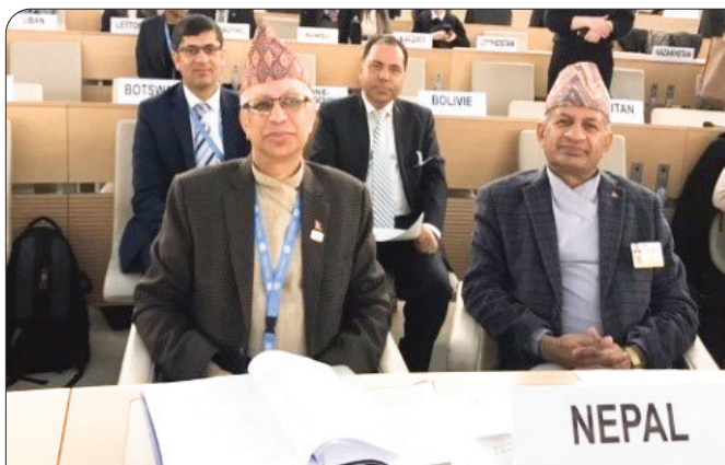
Minister for Foreign Affairs Mr. Pradeep Kumar Gyawali (First Right) and the Members of the Nepali Delegation at the 43rd Session of UN Human Rights Council, Geneva, 25 February 2020

In his address, the Foreign Minister highlighted the provisions enshrined in the Constitution of Nepal, which includes the commitment