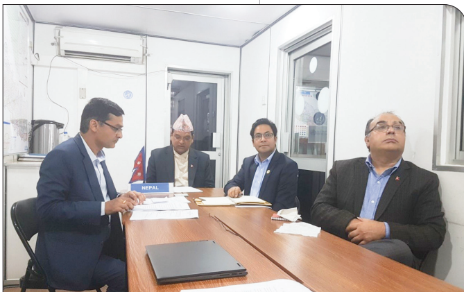
State Minister for Health Mr. Nabaraj Raut (Second from Left) with the Nepali delegation at the SAARC Health Ministers' Video Conference, 23 April 2020

Nepal participated in the SAARC Health Ministers' Video Conference held on 23 April 2020. Hosted by Pakistan, the SAARC Health Ministers' conference discussed the country perspectives and measures