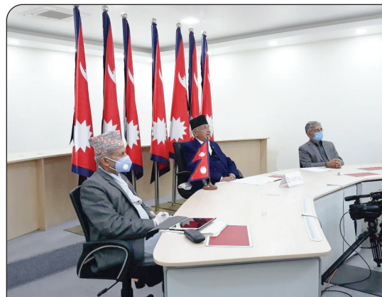
Prime Minister Mr. K P Sharma Oli delivering the statement during the Virtual Summit of NAM on COVID-19, 4 May 2020

Prime Minister Mr. K P Sharma Oli addressed "the Virtual Summit of the Non-Aligned Movement on the