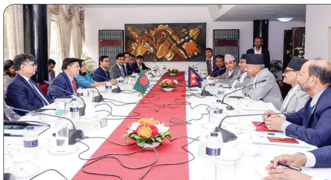
Foreign Minister Mr. Pradeep Kumar Gyawali with Dr. A. K. Abdul Momen, Minister of Foreign Affairs of Bangladesh, Dhaka, 18 February 2020

During the visit, the Foreign Minister met with Mr. Tipu Munshi, Minister of Commerce of Bangladesh and discussed the ways and means to increase bilateral trade, including through expanding Nepal's export to Bangladesh and increasing connectivity between the two countries.