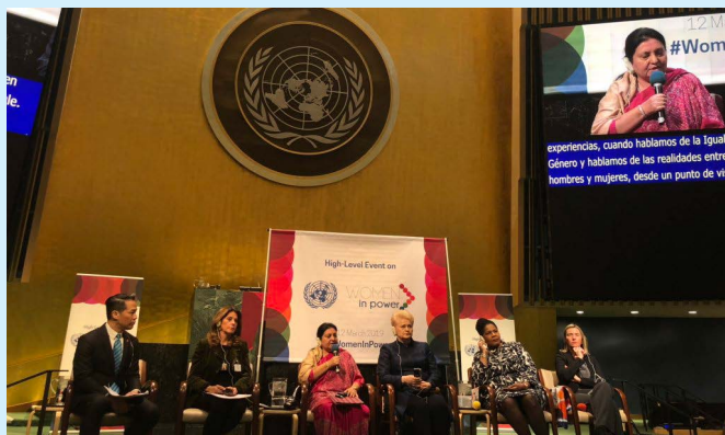
The President addressing the High-Level Event on Women in Power

The President addressed on the theme of “How Women Leaders Change the World” in the High-Level Event on Women in Power hosted by the President of the UN General Assembly (PGA) Ms. Maria Fernanda Espinosa Garcés on 12 March.