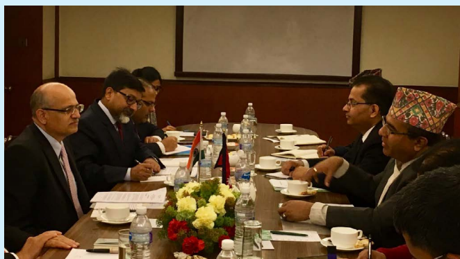
Secretaries of Nepal and India during a Bilateral Meeting