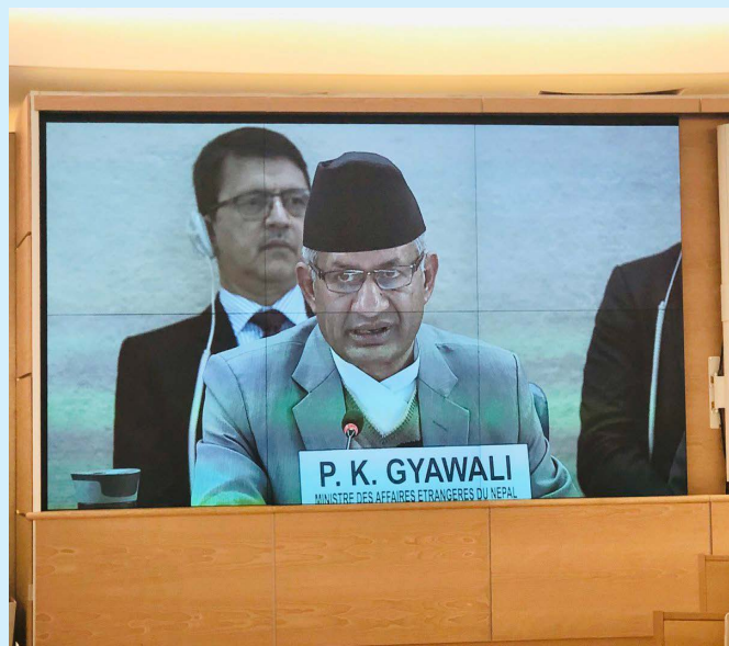
The Minister for Foreign Affairs addressing high-level panel on the question of death penalty

Nepal considers the right to life as sacred and inviolable, and a basis for all human rights, and affirmed Nepal's conscious choice to go for complete abolition of death penalty.