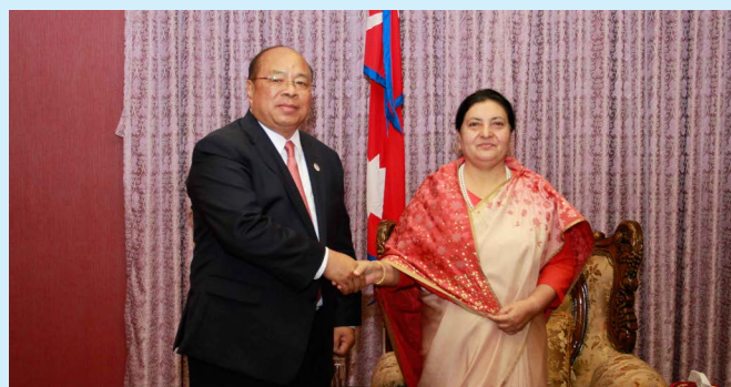
The President during call on by Union Minister of the Republic of the Union of Myanmar