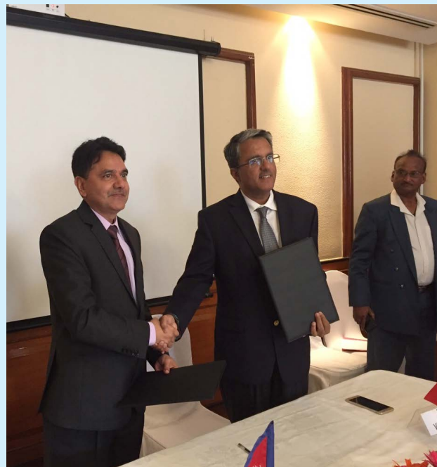
Second Meeting on Inland Waterways Connectivity between Nepal and India

The meeting decided that as further technical detailing would be required, the development of waterways in Nepal should be considered in three phases (short term – 1 to 2 years, medium term – 2 to 3 years and long term – 3 to 5 years). The detailed contours of the three phases should be prepared through the technical assistance of a multilateral funding agency which has the necessary experience of developing inland waterways.