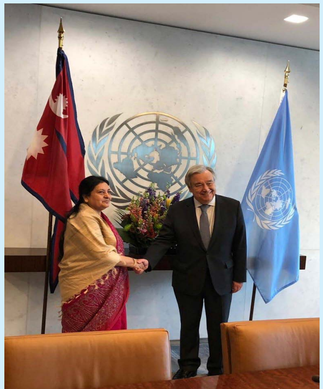
The President meeting with the Secretary-General

On the sidelines, the President held a meeting with António Guterres, the Secretary-General of the United Nations on 12 March. The significance of multilateralism was discussed and views on climate change, SDGs, peacekeeping were exchanged in the meeting. The President appreciated the Secretary-General for his reform agenda and for maintaining gender parity in all United Nations bodies.