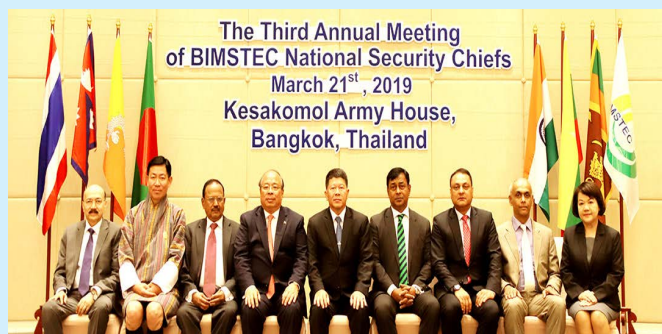
Head of Nepali Delegation (third from right) with other delegates

The BIMSTEC Secretariat presented reports of various Meetings of different subgroups under CTTC that were held after the Second Meeting of NSC on 28 March 2018.