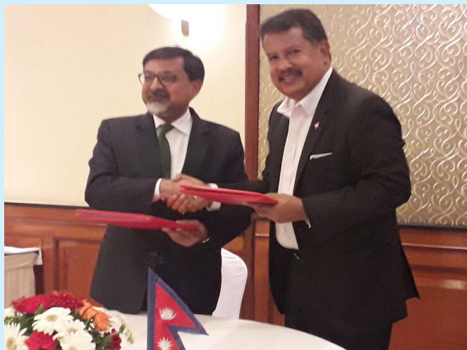
Meeting of Joint Project Monitoring Committee