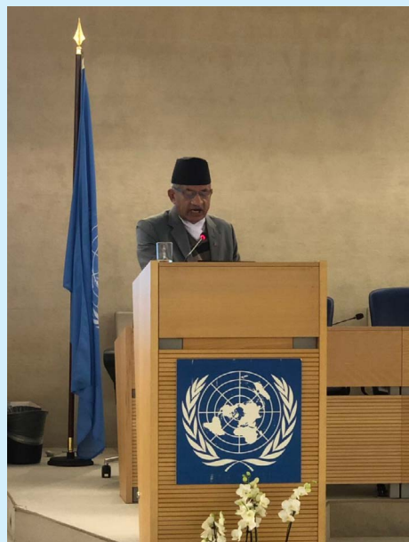
The Minister for Foreign Affairs addressing the high-level segment of the 40th session of the UN Human Rights Council

The Minister attended the opening of the 40th Session of UN Human Rights Council on 25 February and addressed the high-level segment on 27 February.