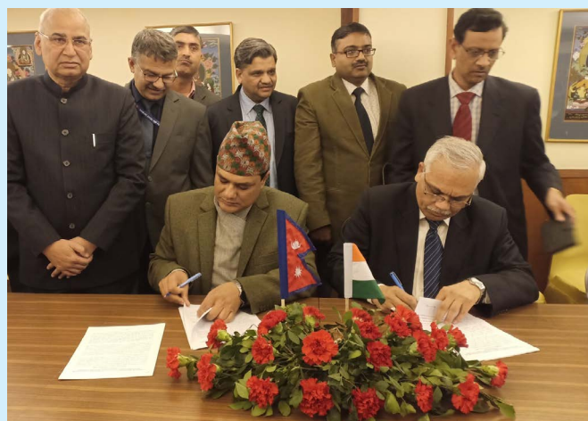
Meeting of Nepal-India Team of Experts

The ToE agreed to finalize the work done by the technical sub-groups in the second Team of Experts meeting. The meeting also discussed on the remaining sections of the DPR, namely benefit assessment and project optimization, cost estimation and phasing of expenditure, and economic and financial evaluation of the project so as to complete the task assigned by the Pancheshwar Development Authority.