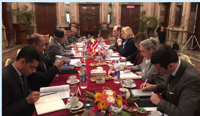
Delegation level talks between Minister Gyawali and Minister Kneissl

During her visit, Minister Kneissl had delegation-level official talks with Minister Gyawali on 22 February. During the talks, the two leaders reviewed the status of Nepal-Austria relations and explored ways to further strengthen the bilateral cooperation.