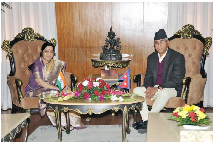
Figure 3 The Minister of External Affairs of India, Smt. Sushma Swaraj with the Prime Minister of Nepal

During the calls on, Minister of External Affairs of India expressed pleasure on behalf of the Government of India over the successful holding of elections of Local levels, Provincial levels and Federal Parliament in Nepal.