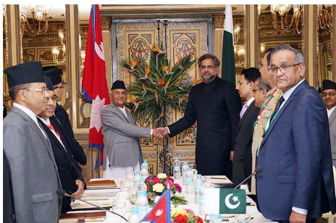
Figure 1 Prime Minister of Nepal Mr. K.P. Sharma Oli with Pakistani Prime Minister

The Prime Minister of the Islamic Republic of Pakistan Mr. Shahid Khaqan Abbasi paid an official visit to Nepal from 5-6 March 2018.