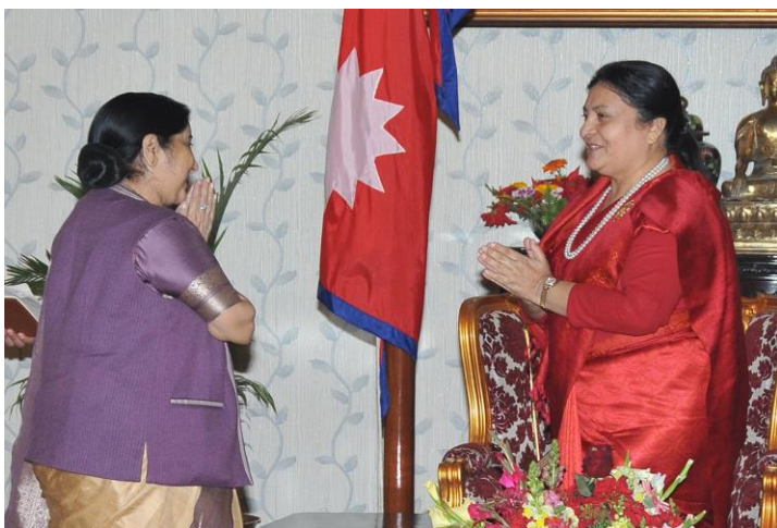
Figure 2 The Minister of External Affairs of India, Smt. Sushma Swaraj with the President of Nepal.

During the calls on, Minister of External Affairs of India expressed pleasure on behalf of the Government of India over the successful holding of elections of Local levels, Provincial levels and Federal Parliament in Nepal.